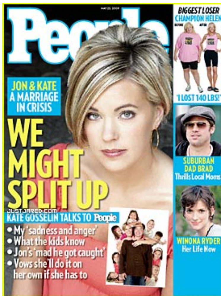
Kate Gosselin on the cover of People Magazine

Viewers were outraged for a number of reasons. Jon and Kate had been married for ten years. They were raising a set of sextuplets along with two other children. And soon after the scandal broke, Kate was accused of having an affair with her bodyguard . Yet the biggest outrage centered on the fact that Jon and Kate initially refused to discuss the matter in the press. By keeping such an important aspect of their marriage off screen, they were violating a tacit agreement with the viewers who had made their show a hit. These two upstart reality stars were only famous because they had agreed to allow cameras to photograph their personal lives, and now they were censoring the juiciest details. Many fans considered this a serious ethical violation.