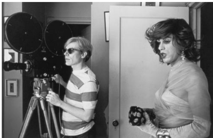
Andy Warhol and Mario Montez on the set of Chelsea Girls

Today, this irony-laden ethos pervades nearly all so-called "reality programming." The formula is simple: outrageous behavior = more screen time. Thus reality stars are incited to break with traditional norms in increasingly shocking ways. In such a context, pro-social behavior is commonly ignored, while anomie becomes its own reward.