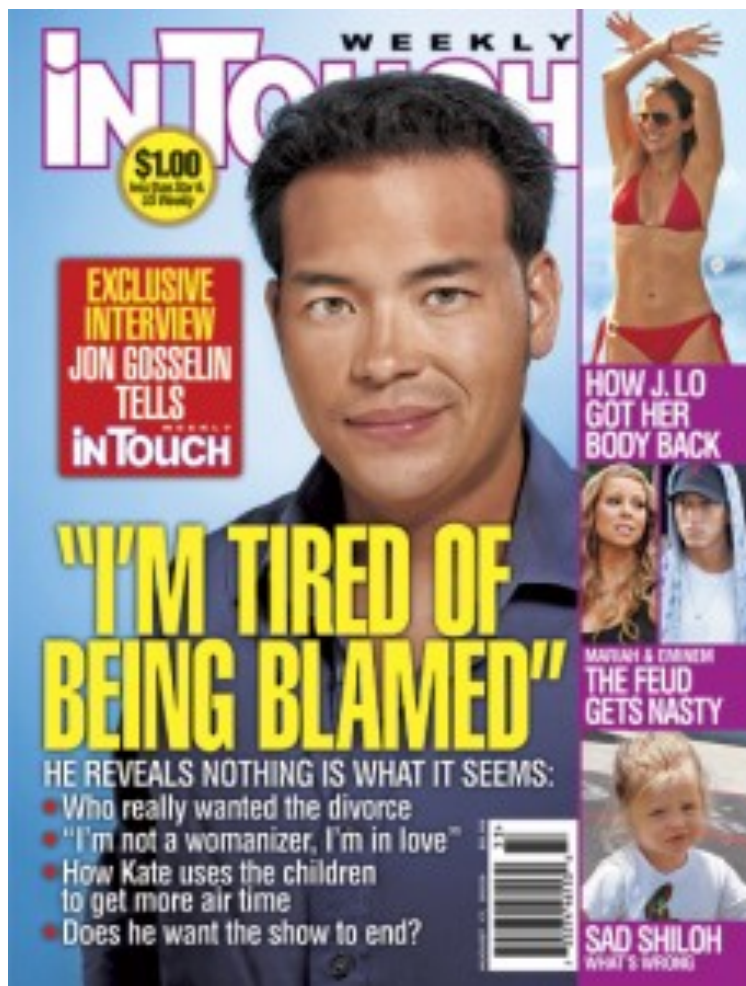
Jon Gosselin on the cover of In Touch