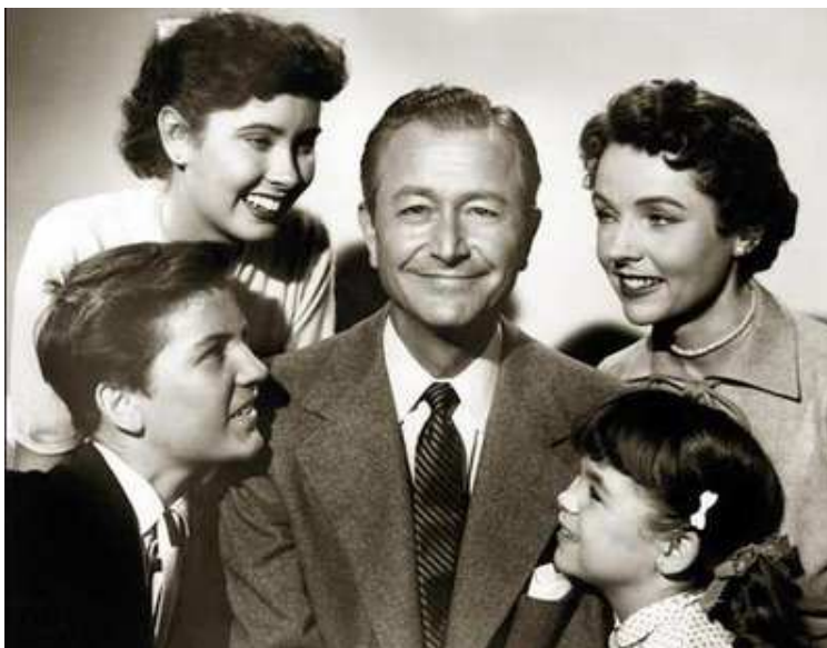
Father Knows Best – NBC, 1954-1960