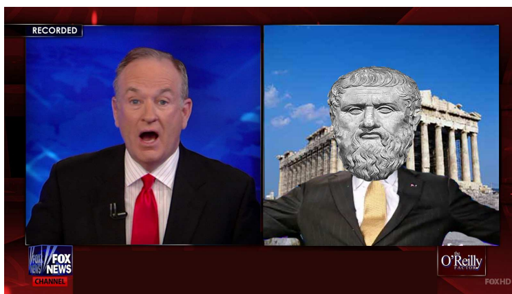
Bill O'Reilly “mash up” illustration provided by author.