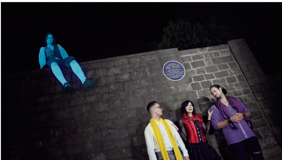
Figure 3. Colour-coded characters.

In cognitive science, a concept closely related to 'matching bias' is 'the contrast effect.' This occurs when a phenomenon is perceived in a distorted or exaggerated manner based on the phenomena that precede it (Hartzmark and Shue 2018, 1568). A face may look more or less attractive depending on the appearance of the face seen before it. A stream of water may feel hotter or colder due to the temperature of the water touched before it. In the case of Shelley's Heart , the contrast effect serves to accentuate differences between contemporary mores and the era in which the romantic poets thrived. For instance, we learn that in Lord Byron's day sodomy was punishable by death, which is why Lord Byron had to keep his bisexuality hidden. In contrast, Modern Byron is very open about his attraction to both men and women. Likewise, we learn that Mary Shelley was ostracized and stigmatized for being an unwed mother, yet Modern Mary makes no attempt to hide her pregnancy or apologize for it. The contrast between the modern characters and their historic antecedents amplifies our awareness of the cultural changes that have occurred since the nineteenth century. The fictional characters in Shelley's Heart are not meant to be literal