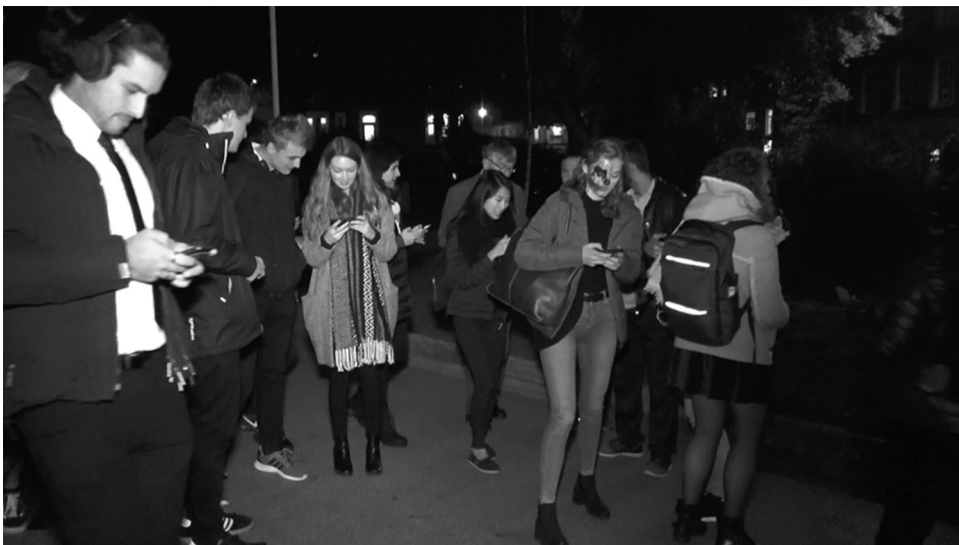
Figure 1. Shelley's Heart : Locative debut.