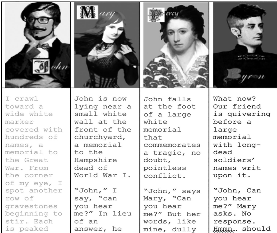
Figure 2. Early script page, parallel format.