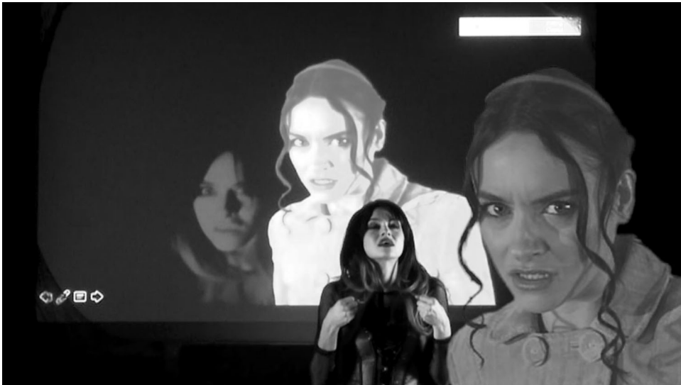
Figure 14. Meta-media collage in Shelley's Heart .

In each scene, multiple realities collide: old and new, real and supernatural, cinematic and theatrical, mimetic and poetic. The ultimate effect of all of this mushrooming complexity is a strategic juxtaposition of the literal and the literary, celebrating their dynamic interplay. As each of the 4 story-paths approaches its climax, fact and fiction increasingly blur as the modern day characters have more frequent and intense encounters with their historic forbearers. Finally, the membrane separating living and dead is ruptured entirely and these fictional characters come face-to-face with their historic counterparts.