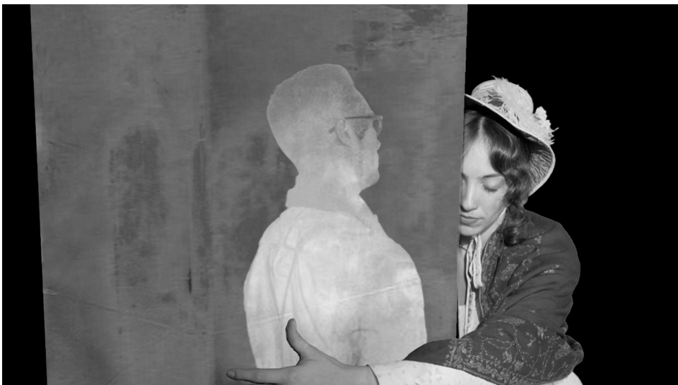
Figure 9. Animation of Fanny and John

Effective dual process design operates in different ways in different contexts, but none of the MAP strategies work in a vacuum. The concluding section will consider what happens when all three of them are deployed simultaneously.