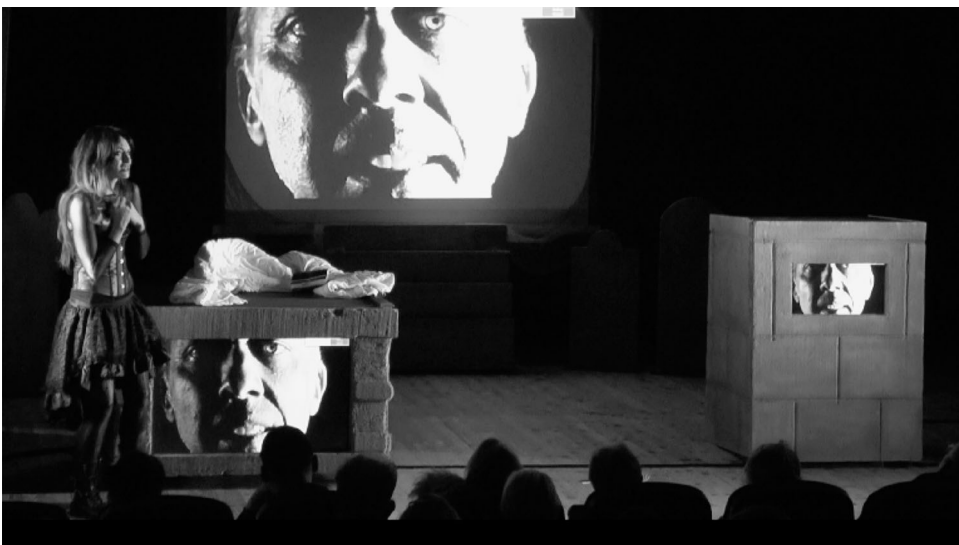
Figure 10. Shelley's Heart : Stage Production, 2017.

Through its various iterations, Shelley's Heart generated effective ambiguity in a variety of ways. One example of this involved projecting footage of actors performing next to the Shelley tomb onto three monitors on a stage in the Shelley Theatre, a converted manor house in Boscombe once owned by Percy Florence Shelley, the one surviving heir to Mary and Percy Bysshe Shelley. In November of 2017, a year and a half after that original field test, this interactive performance linked the tomb and the theatre via a high tech media array. Audience members were empowered to determine the course of the dramatic action by voting with radio-response clickers. This triggered live actors playing Mary, John and Byron to remotely explore sites in St. Peter's churchyard while interacting with multimedia images representing various supernatural visions, including Mary's morbid creation, the monster. Through this amalgamation of narrative tropes, historical facts, and physical and virtual spaces, the audience was able to reflect on the lives and works of the Romantic poets and their modern counterparts in a variety of novel ways (Figure 10).