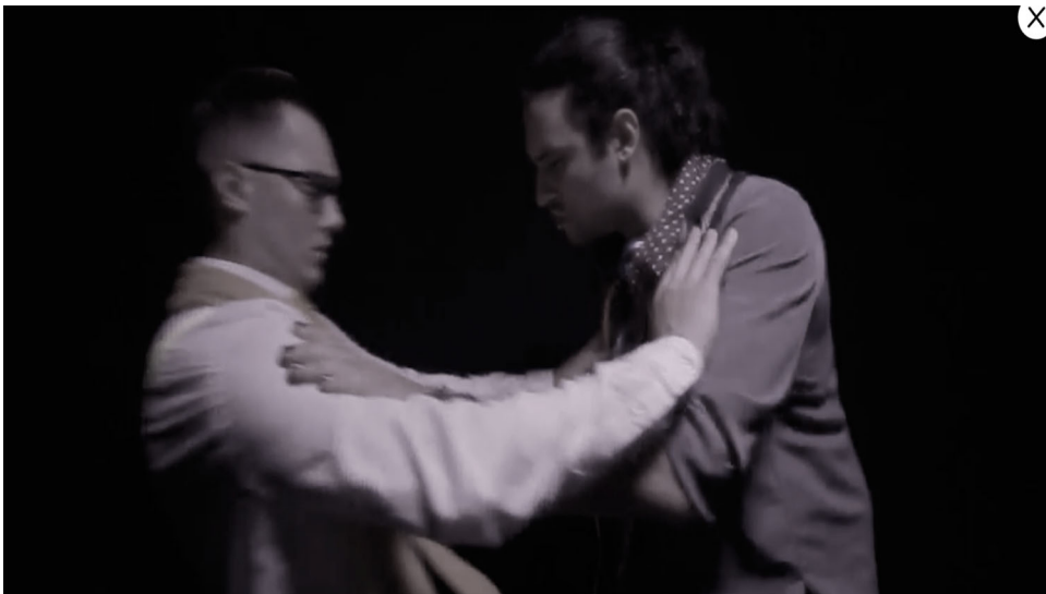
Figure 7. John shoves Byron away.