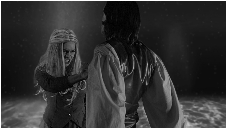
Figure 12. Harriet grabs Percy's heart.

Incorporating ambiguity into a story structure always involves a degree of risk. If dramatic elements are combined too haphazardly, confusion will result and narrative momentum will grind to a halt. Therefore, creating one of the most ambiguous sections in the Percy path presented a significant challenge. The sequence in question involves a confrontation between Percy Shelley and the wife that he abandoned, Harriet Shelley. It features several moments in which fantasy and reality are intricately intertwined. As the biographical details framing this sequence make clear, both Percy and Harriet died of drowning. He perished in a shipwreck off the coast of Italy, and she committed suicide by diving into the Serpentine, a lake in Hyde Park. There are also elements of dramatic exposition where Harriet describes how Percy left her when she was pregnant with their second child. However, the actual clash between these two characters is an obvious fabrication. It happens underwater after both of them are dead and, in its climactic moment, Harriet thrusts her hand into Percy's chest and tears out his still-beating heart (Figure 12).